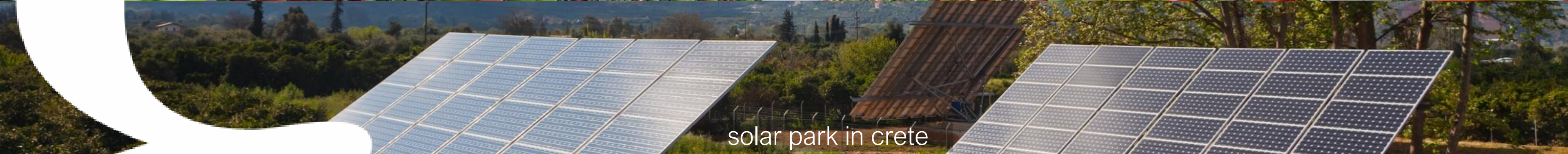
solar park in crete