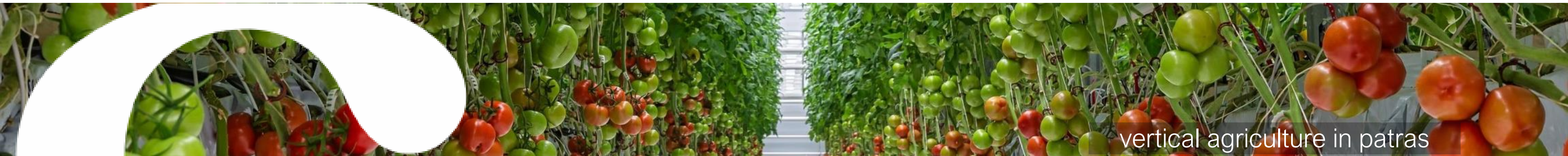
vertical agriculture in patras