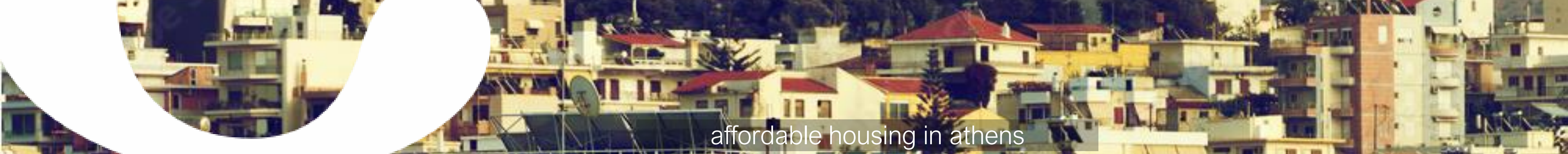
affordable housing in athens