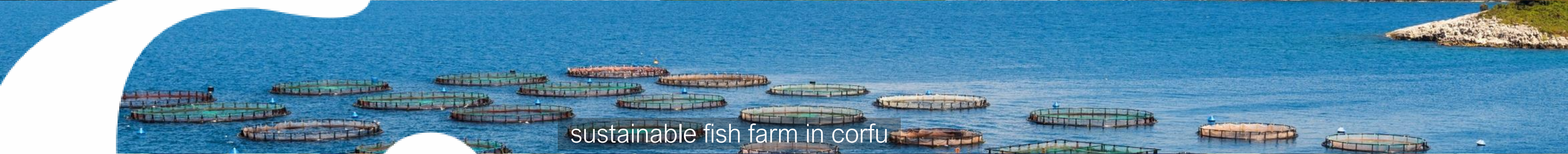
sustainable fish farm in corfu